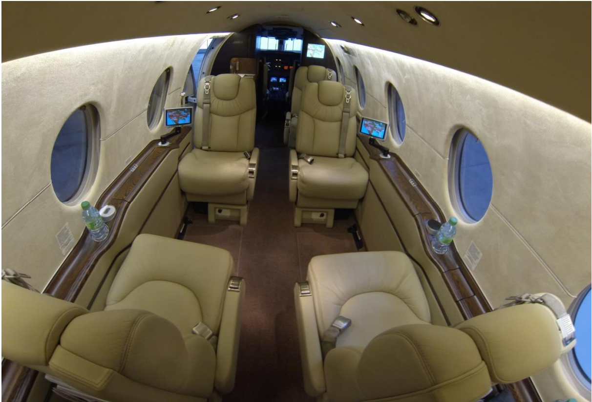
Interior: 7+1 passengers accommodation, beige leather interior, galley.